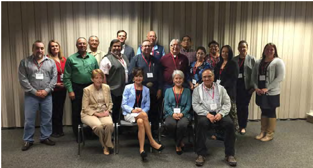
Members of the Native American Student Achievement Advisory Council, April 28, 2015